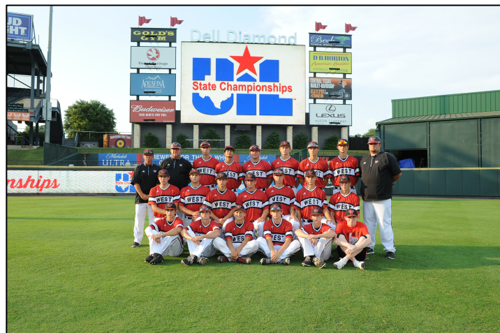
West 3A State Champions