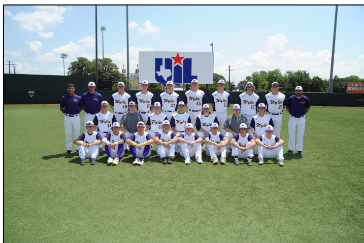
Abilene Wylie 4A State Champions