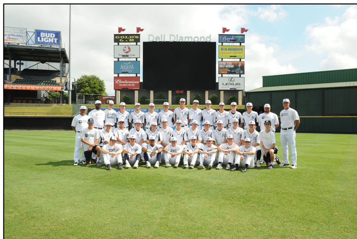
Dallas Jesuit College Prep 6A State Champions