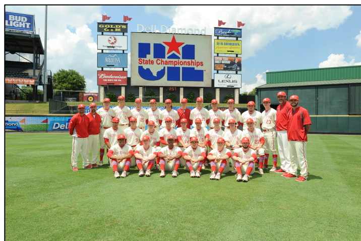
Grapevine 5A State Champions